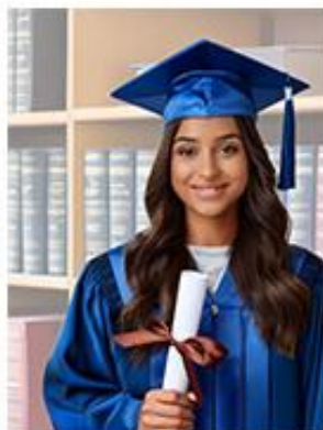
^ 9x12 Poster